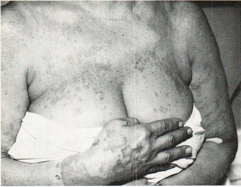
Fig. 1. Fifty-seven-year-old patient (case one) with papular and plaque-like lesions of granuloma annulare confined to light-exposed portions of the body.

examined at that time, she reported that the eruption reappeared suddenly. She then stopped the Prolid ® and the rash involuted. She never resumed the Prolid ® . The chloroquin was later reduced to a dosage of 250 mg every second day. When last seen, 2 months later, the patient's skin was absolutely clear.