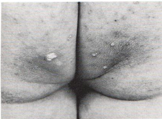
Fig. 6. Superficial disseminated eruptive form of Porokeratosis Mibelli.