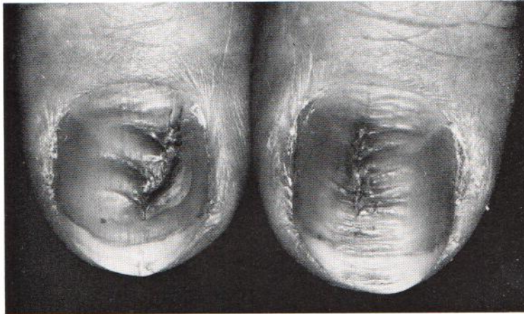
Fig. 5. Dystrophia unguis mediana canaliformis.