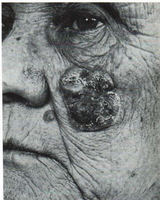
Fig. 1. Lupus erythematosus hypertrophicus et profundus.

A 43-year-old female whose nails were normal until the age of 10 years. Thereafter first transverse striae appeared on the thumbnails and later a longitudinal striae which partly split the nail (Fig. 4). The deformity disappeared for a time, but reappeared later, and for the past 10 years it has remained.