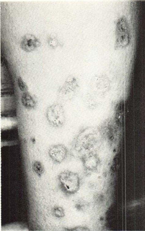
Fig. 3. Pretibial area of Case II. Note the hyperpigmented papular border of the ulcers.

Case II. The patient, a 24 year old negro female, was admitted to The Martland Hospital Unit of the New Jersey College of Medicine and Dentistry with complaints of a rash, shortness of breath and hemoptysis. She was born and raised in rural South Carolina. There had been no unusual illnesses or symptoms until about seven years before hospitalization when she developed asymptomatic "sores" on the legs and shortness of breath. A scalene node biopsy performed in South Carolina at that time was interpreted as sarcoidosis. Since that time she had been treated intermittently with small doses of steroids.