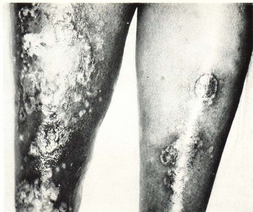
Fig. 1. Pretibial areas of Case I showing extensive leg ulcers. The borders are distinctly papular.