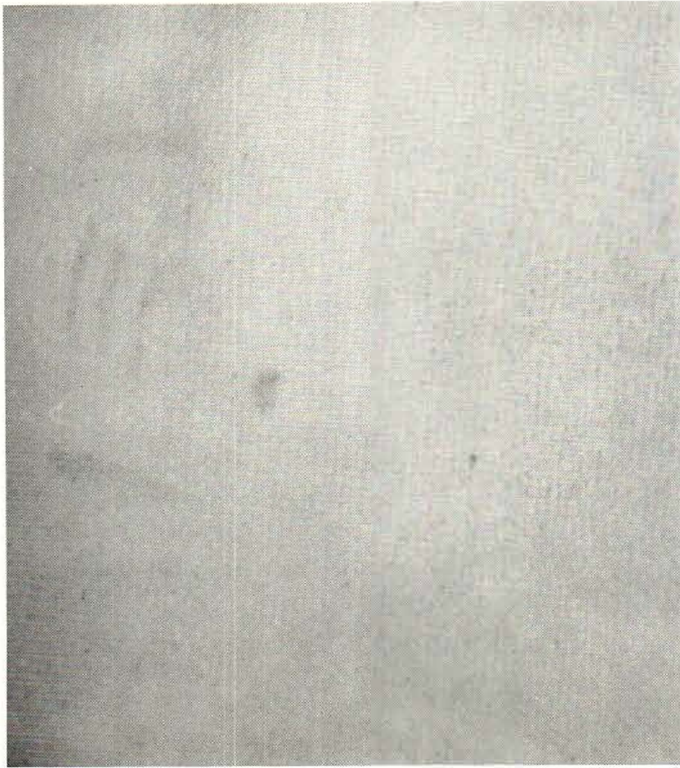
Fig. 3. The skin of a human recipient: positive result of passive transfer of capillarotoxic serum factor stimulated by heparin.

to healthy individuals suggests an indirect and auxiliary role of this mediator by causing haemorrhagic changes in patients with acute hyperergic purpura.