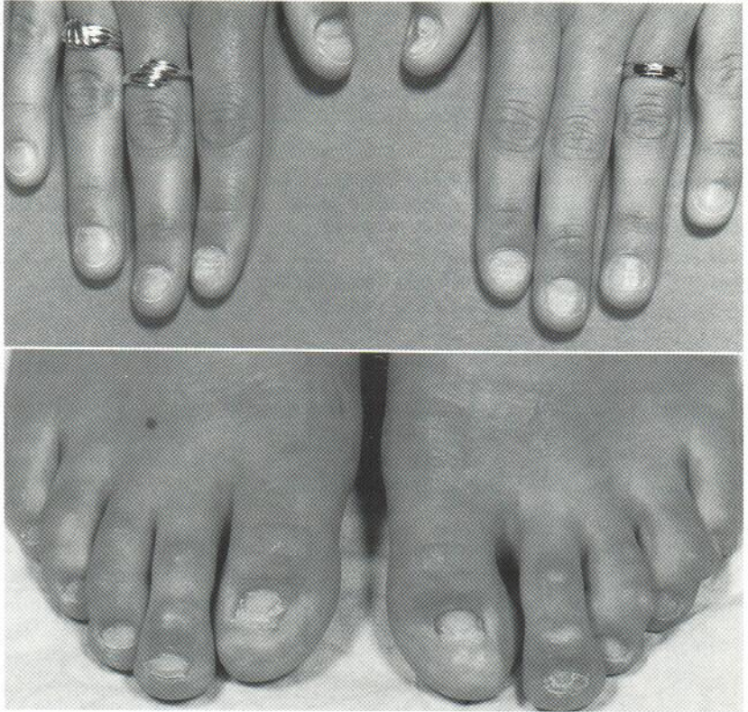
Fig. 2. The finger-nails of the same patient 7 months after treatment with topical PUVA.