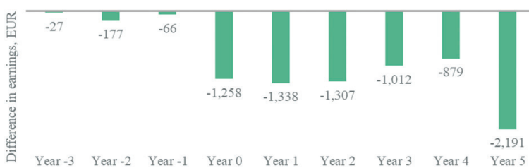
Fig. 2. Difference in gross earnings between patients with moderate-to-severe atopic dermatitis (AD) and their matched reference individuals in each year relative to the index date, in Euro (EUR).

The probability of receiving disability insurance increased from 4.78% in the first year after the index date, to 7.12% 5 years after the index date, and the increase was 4.2 times larger than the corresponding increase for the matched reference individuals. The total productivity