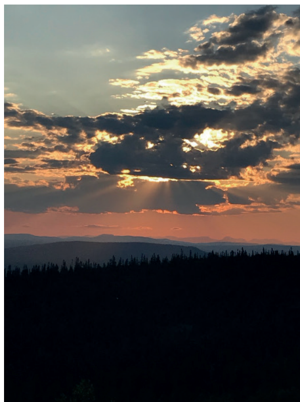
A photo taken just before the sunset in the Northern part of Sweden.

Wishing you all a good summer. Please keep safe!