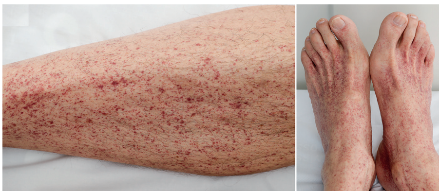
Fig. 1. Petechial purpura on the lower legs in a 56-year-old man. The patient has given written informed consent to publication of the case details.

What is your diagnosis? See next page for answer.