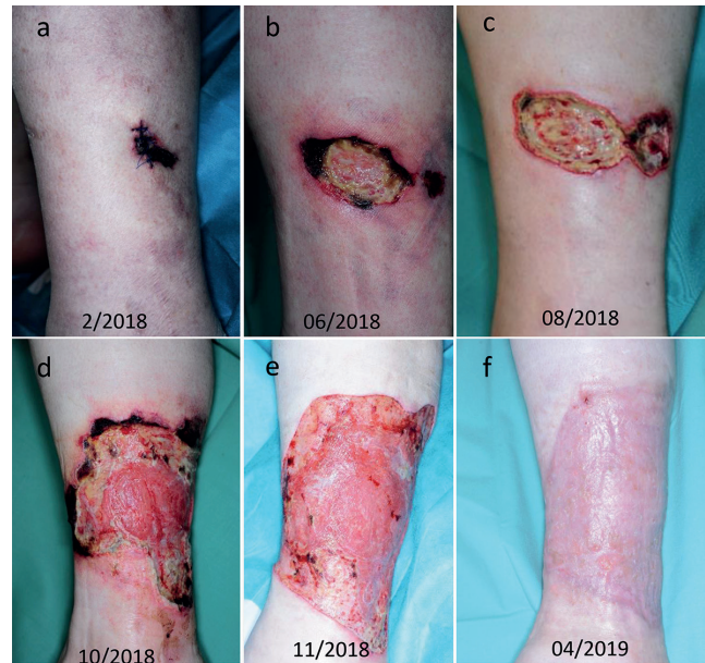
Fig. 1. Clinical course of disease on the left lower leg. (a) Clinical photograph of left lower leg revealing haemorrhagic necrosis. (b) Increase in ulcer size, with necrotic borders, after 4 months. (c) After 6 months. (d) After 8 months. (e) After necrosectomy and split-skin grafting. (f) Fourteen months after first admission.

Despite immunosuppression, subcutaneous heparin, compression stockings, and suitable wound therapy, the ulcers increased in size and depth, especially on the left, previously mildly affected, leg (Fig. 1). To re-evaluate the diagnosis, another deep elliptical biopsy specimen down to the fascia was obtained. For the first time in the current patient, histopathology showed occluded vessels, intima hyperplasia, and media calcifications, supporting the suspicion of Martorell HYTILU (Fig. 2). A spacious operative necrosectomy and debridement of the involved tissue and affected margins and a vacuum therapy were applied; the latter was not tolerated for more than 4 days because of severe pain. In the meantime, immunosuppression was withdrawn. Another operative necrosectomy was needed 14 days after the first because the patient's skin condition deteriorated, with the appearance of new necrotic margins. Split-skin grafts were administered. The patient reported significantly reduced pain after each operation, and long-lasting relief after the second intervention (initial pain medication tramadol, 50 mg at night; metamizole, 4 times/day; naloxone/oxycodone 10 mg/20 mg