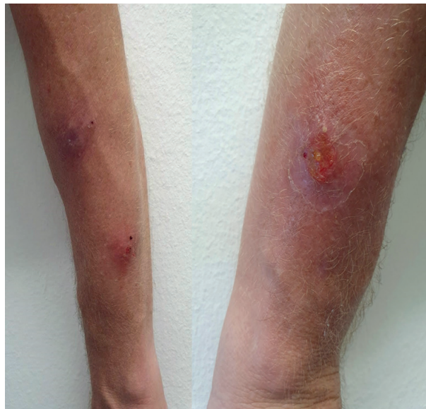
Fig. 1. Reddish-scaly nodules up to 4 cm in diameter with superficial ulceration, draining a putrid secretion on both forearms.

What is your diagnosis? See next page for answer.