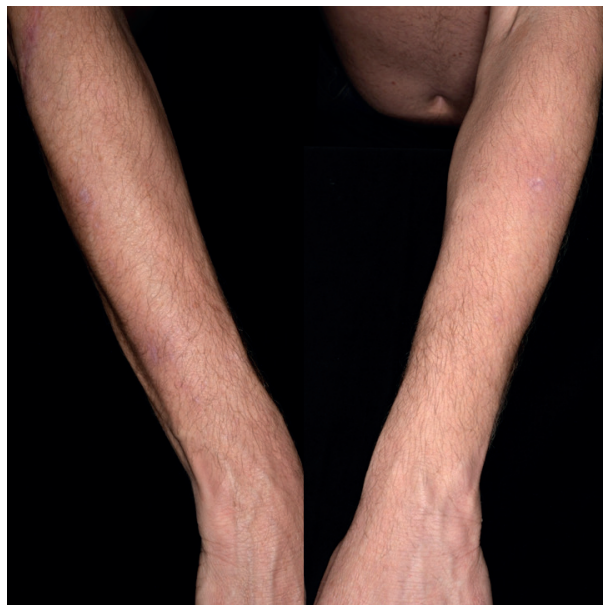
Fig. 3. Almost complete, partially scarred, healing of the nodules on the forearms after antibiotic therapy.

Intravenous therapy with penicillin G (10 mio IU, 3 times daily) for 14 days was initiated. In advance, the patient received oral Jarisch–Herxheimer reaction prophylaxis with 100 mg prednisolone. The therapy resulted in an improvement in skin findings, followed by almost complete healing of the nodules with partial scarring (Fig. 3). Follow-up was scheduled every 3 months during the first year after ending the treatment.