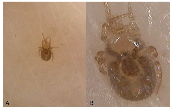
Fig. 2. (A) Dermoscopic aspect (×30) of a mite from the patient’s back. (B) At high magnification (×150) the mite appears red-brown in colour with 4 pairs of limbs, and an ovoidal body engorged with blood.