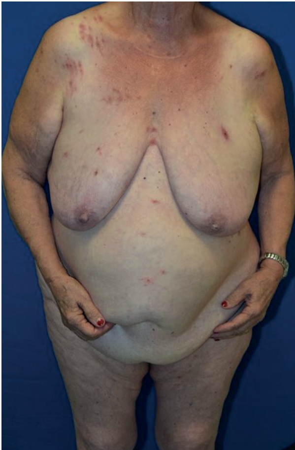
Fig. 1. Clinical examination showing itchy purpuric excoriated macules and papules on the trunk.

What is your diagnosis? See next page for answer.