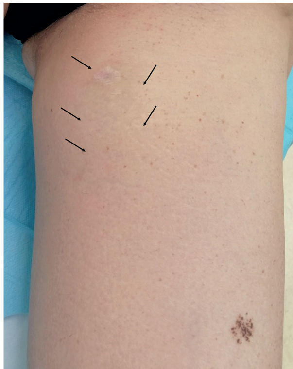
Fig. 1. Five mobile deep-seated nodules on the left thigh.

What is your diagnosis? See next page for answer.