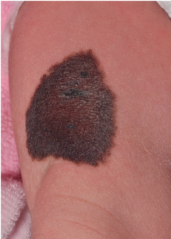
Fig. 1. Medium congenital naevus on the thigh in a 2-month-old girl.