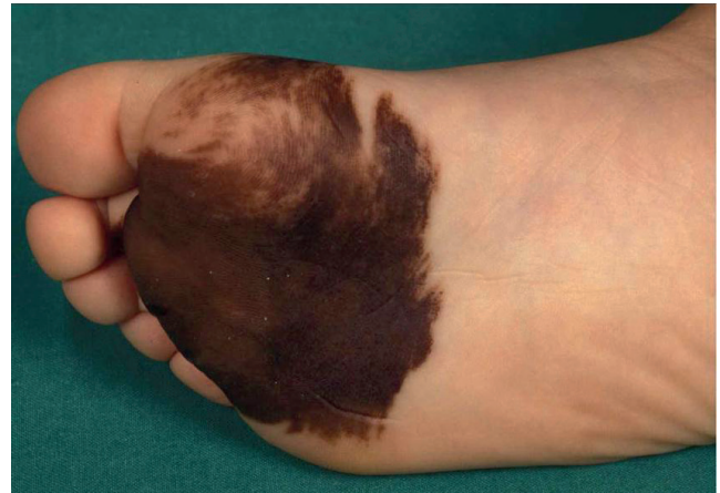
Fig. 2. Medium congenital naevus on the sole in a 6-year-old boy.