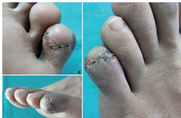
Fig. 3. Follow-up at 3 weeks, after V-Y flap reconstruction.

Once again, this case highlights the importance of dermoscopy and the identification of a vascular pattern