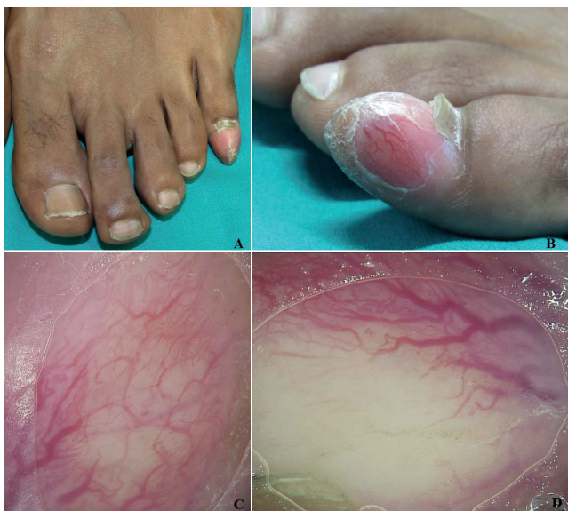
Fig. 1. (A, B) Nodular bullet-like pink lesion with keratotic plug at the end of the left little toe. (C, D) Diffuse monomorphic vascular pattern characterized by arborizing vessels with high variability in length and thickness on diffuse blushing background (non-polarized digital dermoscopy, magnification ×20).

What is your diagnosis? See next page for answer.