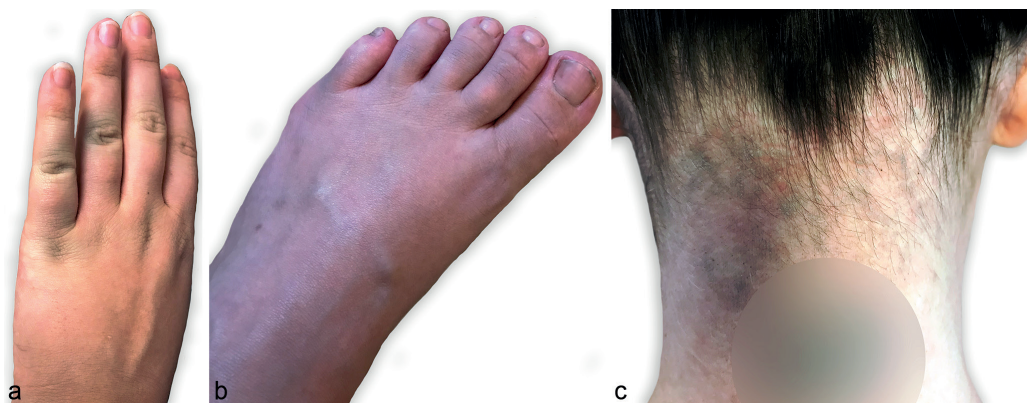
Fig. 1. Clinical photographs. (a) Blue discoloration on dorsal side of the hand primarily covering the joints. (b) Diffuse blue discoloration with an ashen hue on dorsal side of the foot. (c) Diffuse blue discoloration on the neck. Blurred circle covering tattoo.

At the time of presentation, the patient was approximately 7 months pregnant with her first child. She had started daily 25 mg promethazine due to pruritus 6 months earlier. Promethazine was stopped 1 month after presentation with no change in colour intensity. The blue colour was present continuously, but was more obvious after physical activity. It could be removed with soap and water; however, it was more easily removed with alcohol wipes (Fig. 2). The patient also reported staining of her clothes, towels, furniture, and shower. Urine, stool, saliva, and tears were normal coloured.