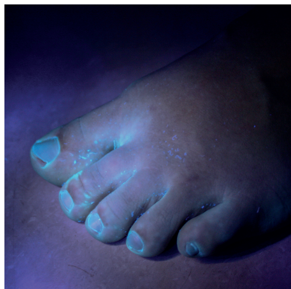
Fig. 3. Fluorescent material on dorsal aspects of the feet (especially interdigitally).

Due to her reports of hypohidrosis, a sweat provocation test with following sweat pH measurements (Jenway pH meter, Model 3510, Cole-Parmer, Staffordshire, UK) were performed. The patient performed 15 min of indoor cycling and 15 min of treadmill running. During this exercise she produced some sweat. However, this was less than was subjectively expected. Her scalp, hair, anterior and dorsal trunk, palms, and feet were surprisingly dry. pH measurements of sweat were considered normal (mean/min–max: 5.6/5.1–6.5). No wheals were induced during exercise.