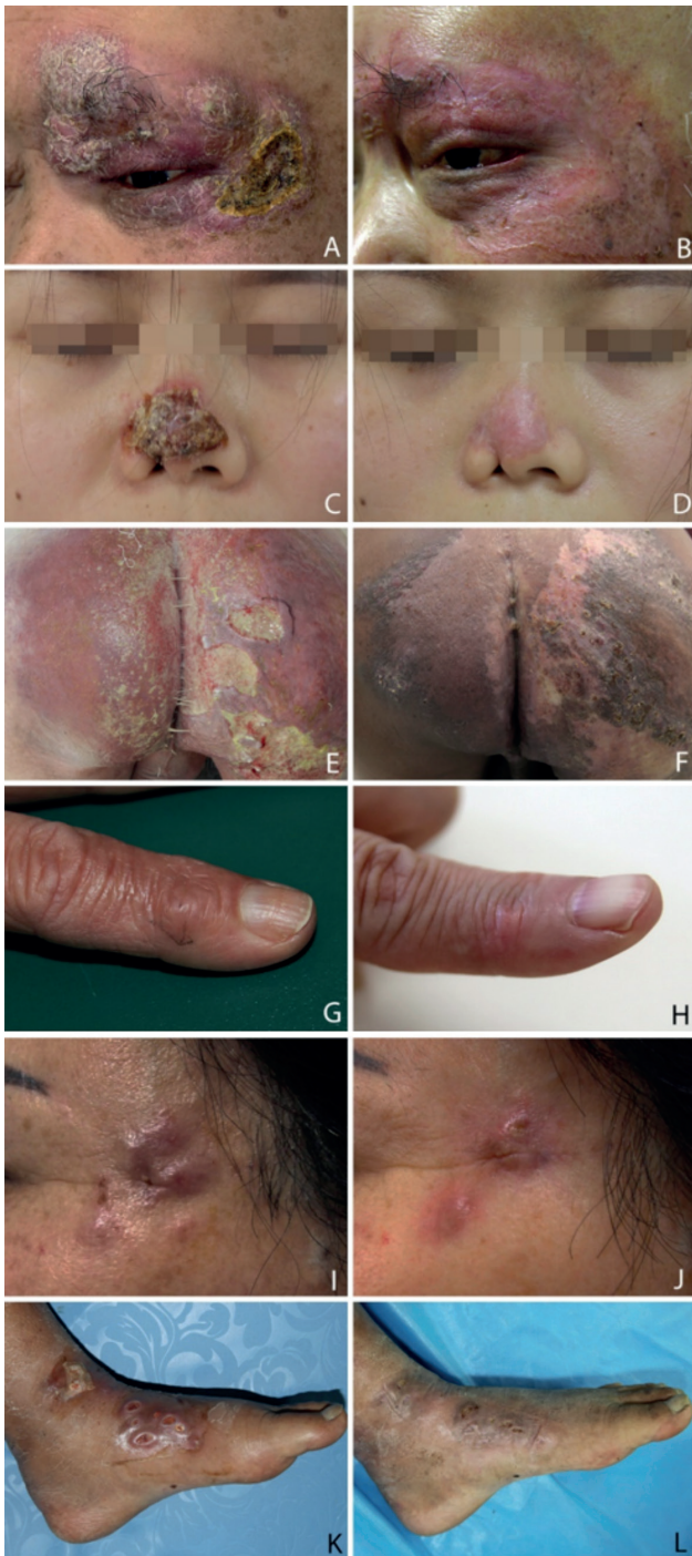
Fig. 2. Cutaneous tuberculosis (TB)/nontuberculous mycobacteria (NTM) infection after antibiotic treatment. (A, B) Tuberculosis verrucosa cutis for 4 months and after 9 months of standard antituberculosis treatment. (C, D) Lupus vulgaris for 5 months and after 3 months of standard antituberculosis treatment. (E, F) Tuberculosis cutis orificialis for 20 years and after 3 months of antituberculosis treatment. (G, H) Mycobacterium marinum infection treated with clarithromycin and moxifloxacin for 6 months. (I, J) Mycobacterium abscessus infection treated with clarithromycin and moxifloxacin for 1 month. (K, L) Mycobacterium chelonae infection treated with clarithromycin and moxifloxacin 2 months.

ture notes a temporal trend in which the prevalence of NTM infection generally rose while the prevalence of MTB declined, although the burden of these diseases