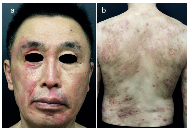
Fig. 2. (a) Face and (b) back after 1 month of treatment with dupilumab. Written permission from the patient is given to publish these photos.

A 58-year-old man had had AD since early childhood. Although remission had occurred in adolescence, eczema had appeared on his trunk and limbs at the age of 47 years. He presented to a dermatologist and was administered topical corticosteroid ointment, betamethasone butyrate propionate, based on the diagnosis of recurrent AD. In 2013 the patient was referred to our university for treatment of a carcinoma of the maxillary sinus using chemoradiotherapy. Treatment was successful. Subsequently, the patient continued treatment for AD in our department. The cutaneous eruption was somewhat controlled by topical treatments; however, at times he experienced intense itching (Fig. 1). He reported a history of allergic rhinitis, conjunctivitis and asthma. Given the severity of his AD, treatment with dupilumab 600 mg, subcutaneously was initiated on the first day, followed by 300 mg every 2 weeks in 2018. Serum examination prior to administration revealed elevated levels of thymus- and activation-regulated chemokine (TARC, 4,634 pg/ml; normal range: <450 pg/ml), IgE (1,280 IU/ml; normal range: <250 IU/ml), and lactate dehydrogenase (LDH, 269 U/l; normal range: 124–224 U/l). The eosinophil count was within normal