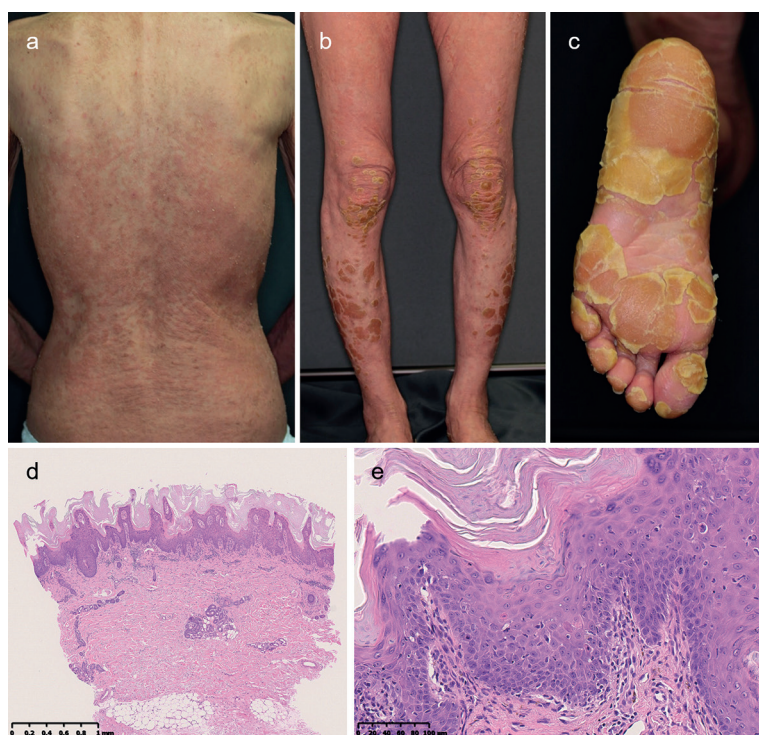
Fig. 1. (a, b) Confluent elevated erythema with scaling on the back and lower legs. Hyperkeratosis scattered on the lower legs. (c) More severe hyperkeratosis on the soles. (d) Haematoxylin and eosin staining revealed parakeratosis and papillomatous acanthosis. (e) A number of necrotic keratinocytes were present in the epidermis, vacuolar changes and lymphocytic infiltration in the superficial dermis.

What is your diagnosis? See next page for answer.