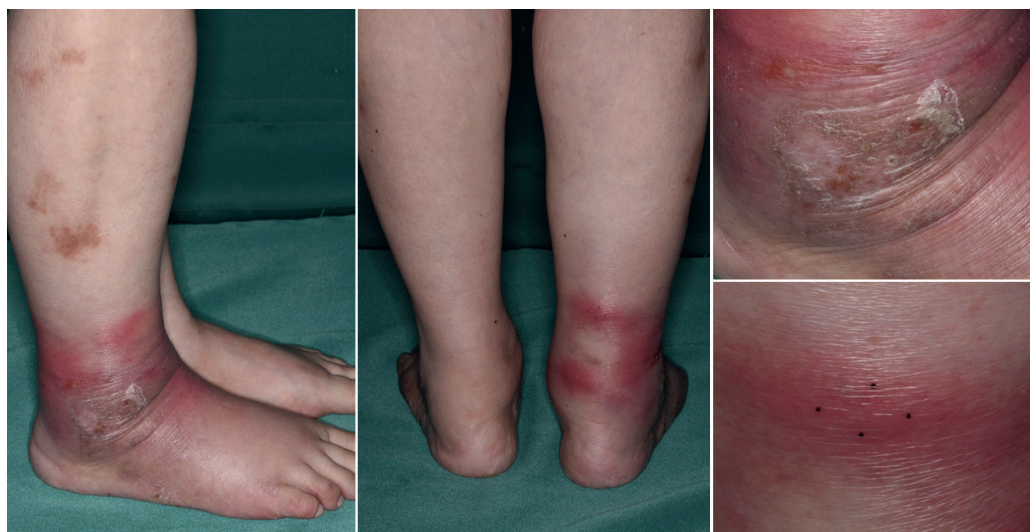
Fig. 1. A red plaque with strong induration of the outer side of the right ankle partly covered with crusts and scales.

We have presented a case of subcutaneous neutrophilic dermatosis comparable to Sweet's syndrome, induced by pegfilgrastim and the existence of G-CSF in the tissue. G-CSF-induced neutrophilic dermatoses, including Sweet's syndrome, have been often reported (5). However, to the best of our knowledge, only 3 cases of Sweet's syndrome (6–8) and one case of pyoderma gangrenosum (9) induced by pegfilgrastim have been reported so