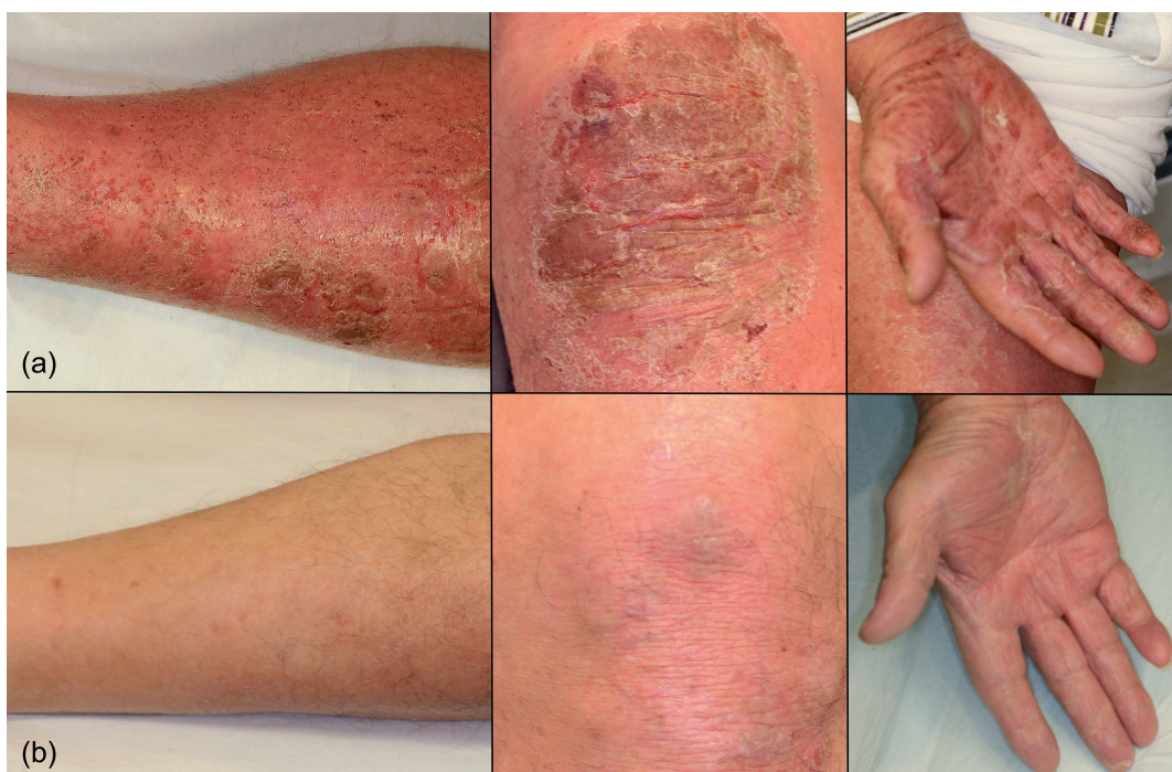
Fig. 1. Clinical findings. (a) After the fifth dose of ixekizumab, both erythema and oedema were observed on most of the body, including the palms and soles. (b) Twelve weeks after the last administration of ixekizumab, the skin lesions were mostly resolved. However, the skin lesions on the knees remained. Minimal scaly erythema was observed on the knees.

Three weeks after the last administration of ixekizumab, the scaly erythema and oedema improved, however, psoriatic lesions were still persistent, especially on palms, soles, and lower limbs. We therefore started oral cyclosporine (150 mg/day) treatment. One week later, these skin lesions gradually improved, and we continued the administration of cyclosporine as the patient refused further biological treatments. Twelve weeks after the last administration of ixekizumab, the skin lesions were mostly resolved.