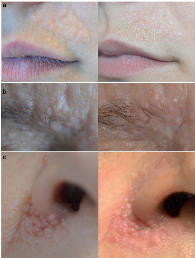
Fig. 2. Multiple trichoepitheliomas localized on (a) nasolabial folds (patient 4), (b) forehead (patient 1) and (c) ala of the nose (patient 3). Evaluation before the start of rapamycin (left), and 5 months of treatment (right).

(2–4 mm), facial trichoepitheliomas, twice daily, alone or after ablative CO 2 laser therapy, for a period of 7 and 12 months, respectively. Treatment was well tolerated and resulted in an interruption of the progression of the lesions, according to the authors. However, no evaluation score was provided. In line with this report, our results suggest that a topical formulation of rapamycin may reduce the thickness and size of trichoepitheliomas and reduce the occurrence of new tumours. However, the overall effect remains limited. This may be explained by incomplete penetration related to galenic formulation or by significant tumour thickness. Efficacy might therefore be optimized by occlusion, adjunction of a solubilizer agent in the formulation to increase rapamycin bioavailability, use of a more concentrated formulation, or concomitant use of ablative laser to reduce lesions thickness as in the report by Tu & Teng (2). Another reason for the limited efficacy could be that less than one-third of the trichoepitheliomas showed positive staining for mTOR (3). The limited efficacy might also be explained