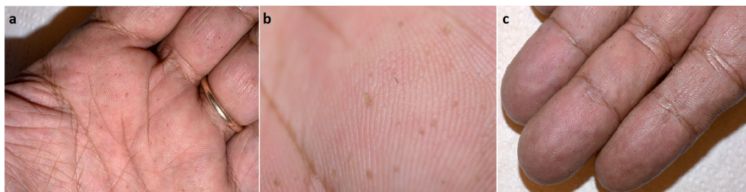
Fig. 1. (a) Multiple brownish-yellowish filiform keratotic papules on the left palm. (b) Close-up on the filiform keratotic lesions on the palm. (c) Filiform keratotic papules on the fingers.

What is your diagnosis? See next page for answer.