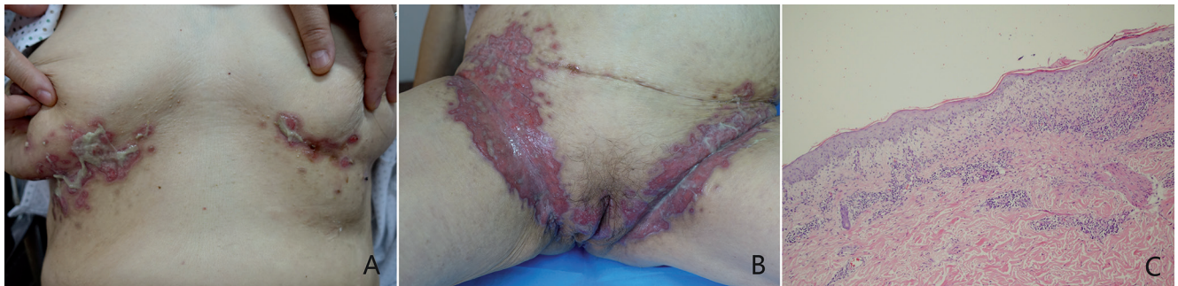
Fig. 1. (A, B) Erythematous papules and erosions in the intertriginous areas, with massive amounts of purulent fluid in the inframammary fold and groin. (C) Skin biopsy showed the presence of a sparse number of plasma cells (original magnification, \times 20 ).

What is your diagnosis? See next page for answer.