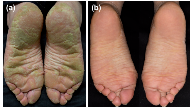
Fig. 1. Clinical presentation of pityriasis rubra pilaris before and after treatment with apremilast. (a) Keratinization and erythema were seen on both feet and knees at initial presentation. (b) Significant improvements in the skin lesions were seen at 6 months after the start of treatment with apremilast.

A 60-year-old woman with no significant medical or family history attended our clinic 4 years ago with a 1-month history of well-demarcated, pruritic erythema keratodes on the hands, soles of the feet, elbows, and knees (Fig. 1a). Keratinizing papules on the palms, and scales on the dorsa of the hands and nail beds, were also seen. No nail-fold capillary abnormalities or nail changes were evident, and she had no systemic symptoms. Skin biopsy at initial presentation showed a “chequerboard pattern” of alternating parakeratosis and orthokeratosis, irregularly elongated rete ridges, acantholysis, and dermal melanin incontinence (Fig. 2a). Based on the clinical and histological findings, she was diagnosed with type I PRP. She developed mild arthralgia 5 months later and was referred to the rheumatology department.