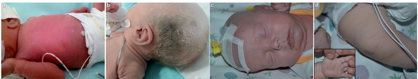
Fig. 1. Patient's clinical features. (a) Erythroderma with oedema and trunk desquamation at birth. (b) Hyperkeratosis with accentuation of skin markings, and desquamation, the latter particularly marked on the partially alopecic scalp, at week 2. (c) Improved ichthyosis manifestations at 2 months of age: (c) forehead hyperkeratosis and scaling with scalp hair, eyelash and eyebrow loss; (d) hyperkeratosis with accentuation of skin markings and mild desquamation of lower limb, and palmar hyperkeratosis ( inset ). Permission is given by the parents to publish these photos.