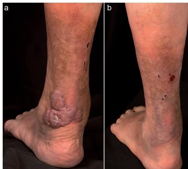
Fig. 1. Clinical course of spontaneous regression in a patient with diffuse large B-cell lymphoma, leg type. (a) Left lower leg before diagnostic biopsy showing a heavily infiltrated, purple coloured, nodular plaque covered by a few scales. (b) Spontaneous clinical regression 2 months after diagnostic biopsy.

A 66-year-old man presented with a 6-week history of a purple tumour on his left lower leg ( Fig. 1a ). The patient's medical history included diabetes mellitus type II, arterial hypertension and chronic venous insufficiency. Fever, night sweats, and weight loss were absent. Histopathology revealed a dense, diffuse infiltrate of immunoblasts and centroblasts admixed with small reactive lymphocytes within the entire dermis. Neoplastic cells showed positivity for CD20, CD79a, PAX5, Bcl-2, Bcl-6, MUM-1 and stained negative for CD3, CD4, CD5, CD8, CD10, CD21, CD30, CD68, cyclin D1, TdT and EBER-1 (Fig. S1 1 ). The Ki-67 proliferation index was approximately 90%. Monoclonal rearrangement of immunoglobulin heavy (IgH) chains was found and mutational analysis of exon 5 (p.L265P) of the MYD88 gene showed the point mutation c.794T>C. Whole-body computed tomography ruled out lymph node or visceral involvement and peripheral blood immunophenotyping was inconspicuous. Radiotherapy of the affected skin was recommended. Unexpectedly, 2 months after the diagnostic biopsy the tumour had almost completely and spontaneously regressed ( Fig. 1b ). Despite almost complete clinical remission a second biopsy was taken.