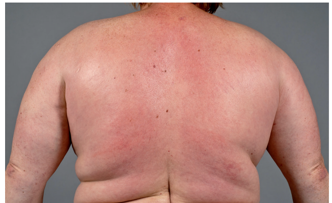
Fig. 1. Scleroedema adultorum Buschke with extensive severe skin thickening and solid oedema of the neck, back, shoulders and upper arms.

The course of scleroedema is usually slow and rarely fatal. Patient’s complaints include tightness, thickening,