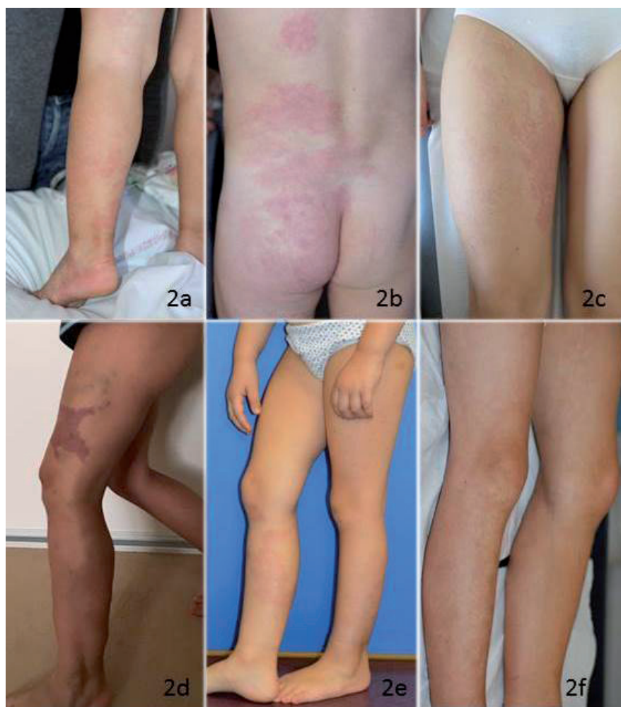
Fig. 2. Examples of clinical characteristics. (a) A 28-month-old boy with widespread capillary malformations (CM) of the left leg (variant p.A99V). (b) A 33-month-old boy, showing CM extending to the back (variant p.A99V). (c) A 9-year-old girl, with CM of her right thigh (variant p.A99V). (d) A 4-year-old girl, showing a geographic-type CM of her left thigh associated with dilated veins and macrocystic lymphatic malformation of her left buttock (variant p.L116V). (e) A 31-month-old girl with bilateral CMs on legs (intronic variant). (f) A 7-year-old boy showing widespread bilateral CMs (variant p.N451S).