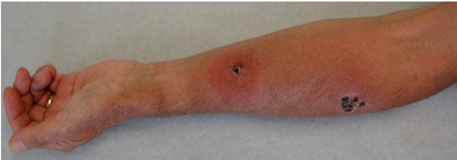
Fig. 1. Clinical findings at the time-point of first presentation. Notable are 2 crusted nodules on the patient's lower-left arm, 1 cm in diameter with a central pore and pronounced surrounding erythema and swelling.

What is your diagnosis? See next page for answer.