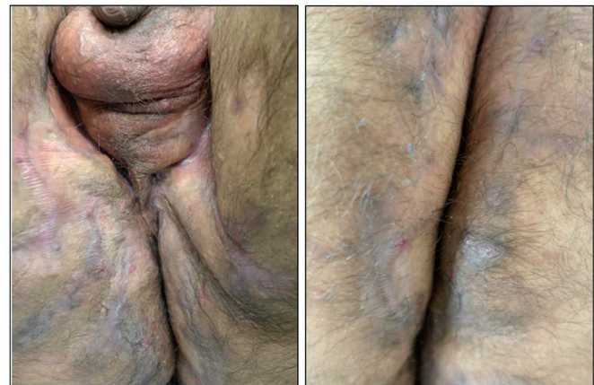
Fig. 1. Rapid clinical response of hidradenitis suppurativa (HS) to secukinumab treatment. Clinical images of the genital and gluteal region (A) before and (B) after 8 weeks of treatment with the interleukin-17A antibody secukinumab, demonstrating rapid reduction in inflammatory nodules and signs of cutaneous inflammation.