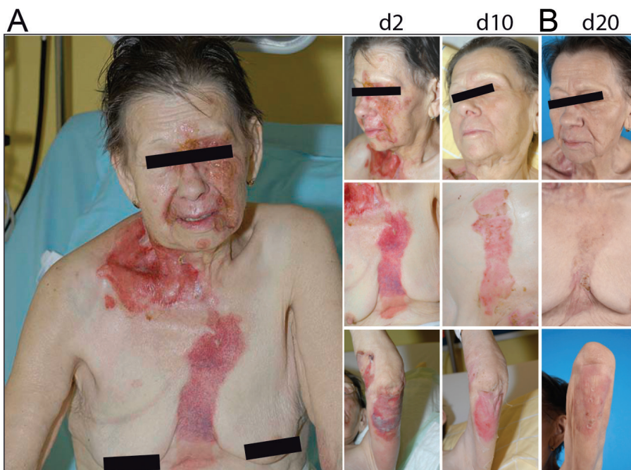
Fig. 1. Clinical course. (A) Flaccid bullae formation of face, neck, trunk and left arm. (B) Twenty days after initiation of antimicrobial therapy, lesions were healed without scarring. A written permission from the patient is given.

Perilesional histology of a fresh bulla showed a neutrophilic infiltrate in the upper dermis, spongiosis and acantholytic split formation in the stratum granulosum (Fig. 2A). A search for pemphigus antibodies yielded negative results. A gram stain of lesional skin revealed gram + cocci in the split (Fig 2B). Bacterial cultures from blood and sputum, as well as swabs of the nose and lesional skin, were positive for methicillin-sensitive S. aureus (MSSA). DNA sequencing of the S. aureus -specific staphylococcal protein A ( spa ) and multi-locus sequence-typing (MLST) revealed spa -type t729, sequence type (ST) 88 for all isolates. Strains were positive for the gene encoding the exfoliative toxin A ( eta ). A diagnosis of SSSS was made and the patient received intravenous piperacillin-sulbactam (4.5 g i.v. 3 times daily for 10 days) until complete remission (Fig. 1B).