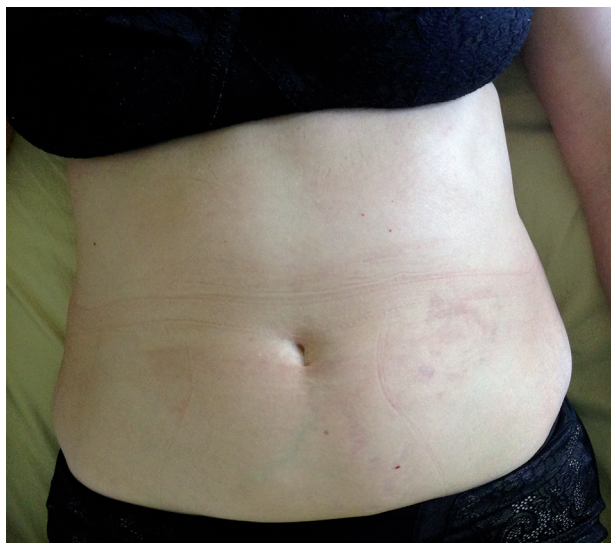
Fig. 3. Healing of skin lesions after oral corticotherapy.

been described in the literature. EGPA cutaneous lesions are present in 40–80% of the patients, including purpura, nodules/papules or urticarial lesions and, less commonly, livedo reticularis, ulcerations and bullous lesions (3–5). Koebner phenomenon has been reported only once in an ANCA-positive patient, occurring on pyoderma gangrenosum scars (6). The Koebner pathogenesis is well known in psoriasis, but is poorly described in vasculitis (7). Nevertheless, skin lesions in granulomatous vasculitis are often located on the fingers and the elbows,