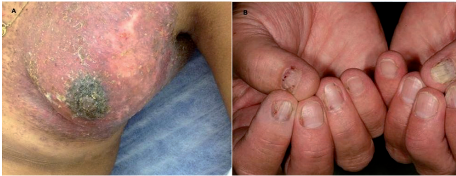
Fig. 2. Langerhans cell histiocytosis. (A) Tumorous lesion of the breast. (B) Lichenoid lesions of the nails.

mucosal involvement (perineal area, 8 patients; mucosal area, 5 patients: erosions, 8 patients; papules/nodules, 2 patients). Lesions were painful in 44% (especially when affecting the scalp) and pruritic in 36% of the patients. Among the 8 patients tested for DLQI during a LCH skin flare, 5 reported a poor QoL (DLQI >10) despite limited body surface area (BSA) involvement. There was a fair correlation between BSA (median 5%, range 2–11) and DLQI (median 11.5, range 2–21) ( p=0.57 ), although it did not reach statistical significance ( p=0.14 ).