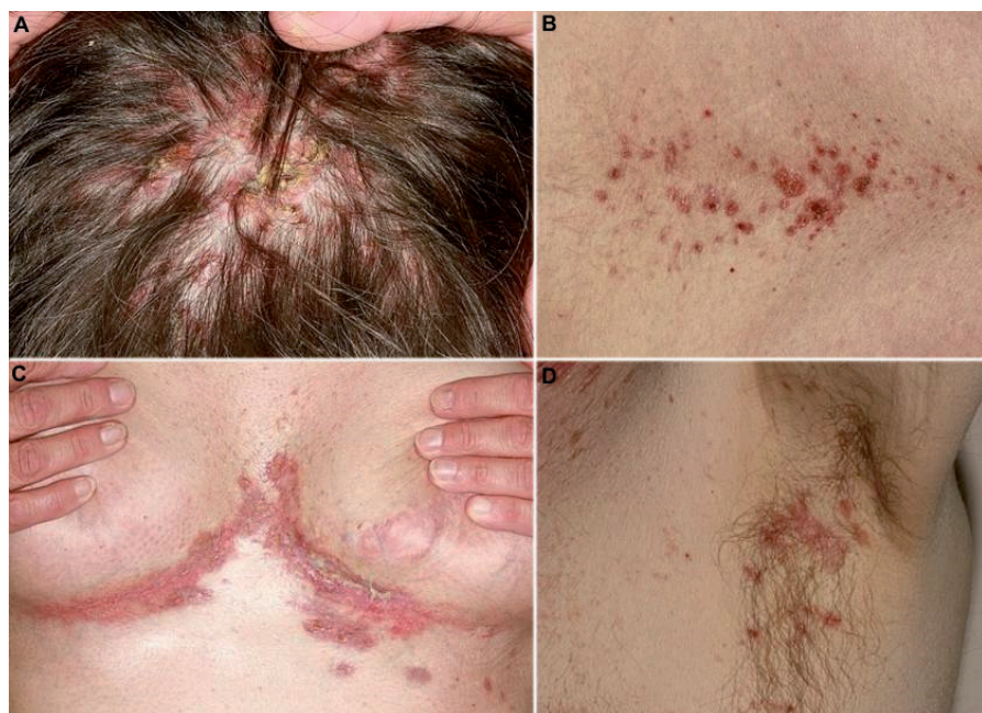
Fig. 1. Typical skin lesions of Langerhans cell histiocytosis. (A) Crusty papules on the scalp, (B) erythematous papules and macules located on the lower back, and (C, D) erosive papules in (C) submammary and (D) axillary folds.