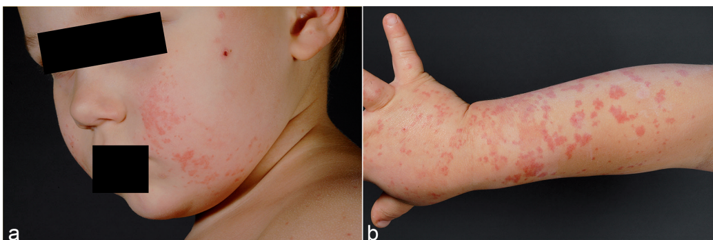
Fig. 2. Patient 2. (a) Erythematous papules and macules on the face. (b) Annular erythematous plaques on the arm of. Permission is given to publish these photos.

We did not commence any active intervention. The rash remitted spontaneously one week later, sponta-