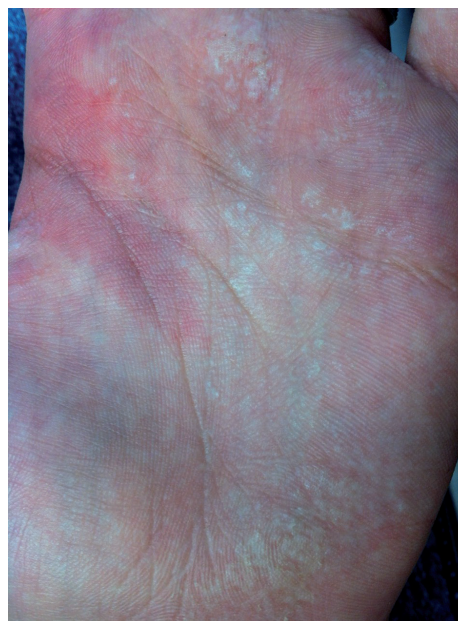
Fig. 1. Aspect of the medio-palmar area after a 3-min exposure to water.

(del14b-17b). Each CFTR mutation was found in a healthy parent (Fig. 2). Based on these results, clinical signs and symptoms were reassigned to a CFTR -related disorder (CFTR-RD). Botulinum toxin injection in her hands resulted in a marked improvement in her APK at 12 months of follow-up.