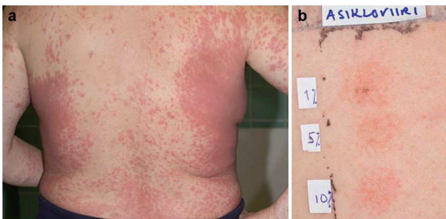
Fig. 1. (a) Symmetrically distributed small pustules on an erythematous base were observed. (b) Positive patch testing with acyclovir (asikloviiri) showing small localized pustules at concentrations 1%, 5% and 10% pet.

AGEP has previously been associated with viral infections, but as the EuroSCAR study revealed, in-