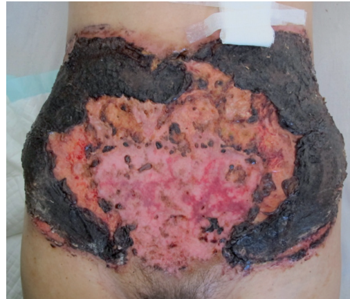
Fig. 1. Skin ulcer on the abdominal wall.

What is your diagnosis? See next page for answer.