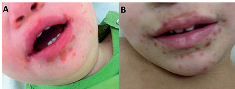
Fig. 3. (A) Perioral vesicles in patient 4. (B) Erosive erythematous papules in patient 8.

Despite increasing reports worldwide of CV-A6 atypical HFMD, clinicians are still unaware of this novel, yet common, childhood viral exanthem. All the patients reported herein were referred to the ER with various misdiagnoses, leading to futile admission, investigations, and occasional treatments. The phenotypic heterogeneity and the extensive distribution of the eruptions in our patients as well as in previous reports, argue that the term HFMD may be a misnomer for this viral exanthem. We sug-