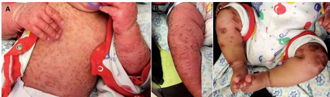
Fig. 2. (A, B) Widespread erythematous and crusted papules and plaques with marked desquamation in patient 2. (C) Crusted plaques with desquamation in patient 3.