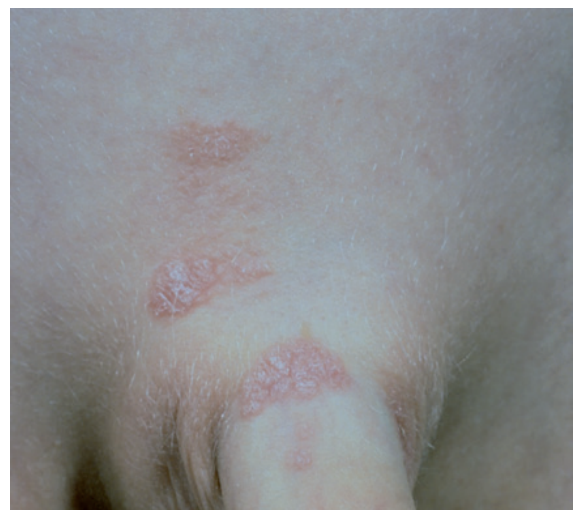
Fig. 2. Genital lesions in a pre-pubertal boy.

Previous studies have reported earlier age of onset in girls (33). This was not the case in our material where gender did not influence age of onset. We have no