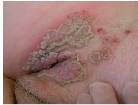
Fig. 3. Vegetating lesions in the patient's right groin.

The mainstay of treatment is corticosteroids. While our case responded primarily to topical steroid with the addition of a short course of first generation cephalosporin, inconsistent response to topical therapy has rather been reported in the literature, especially in the Neuman type (8,