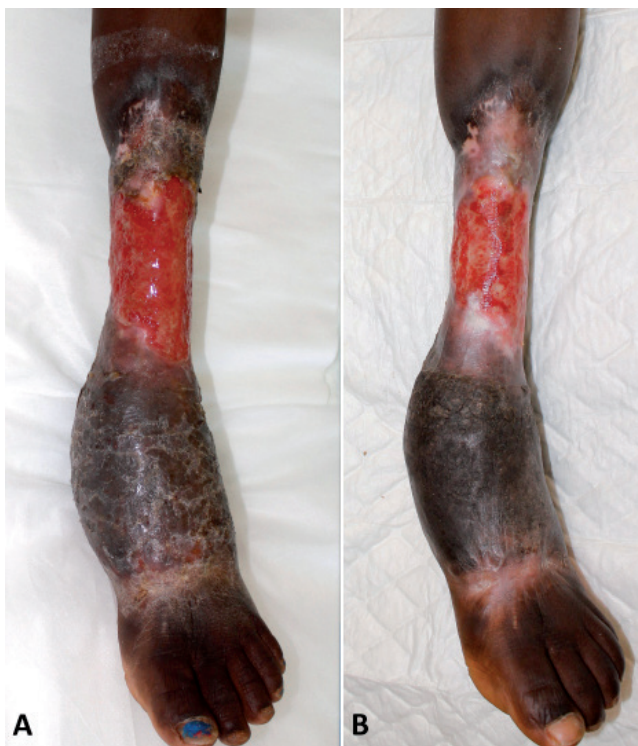
Fig. 1. Buruli ulcer of the lower left leg, ankle and dorsum of the foot. (A) Extensive oedematous ulcerated lesion on initial admission. (B) After 6 months of an oral antibiotic regimen and regular dressings, re-epithelialization of the granulomatous tissues, reduction in the size of ulceration, and decrease in the oedema were observed.

According to the World Health Organization (WHO) recommendations, oral antibiotic regimen, including rifampicin 300 mg/day, clarithromycin 450 mg/day, was started and the ulcer was dressed regularly. Due to the large size of ulceration and the bone involvement, ciprofloxacin 900 mg/day was added and treatment was continued through 6 months. At this time, re-epithelialization of the granulomatous tissues, reduction in size of the ulceration, and decreased oedema were observed (Fig. 1B). The patient returned to Mali with the recommendation to continue treatment for an additional 6 months (total 1 year) before returning to France for a decision on the need for surgical skin and bone management.