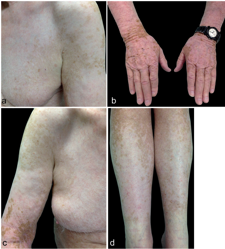
Fig. 1. Generalized vitiligo on left arm and chest (a), hands (b), right arm (c) and legs (d) after treatment with IL-2 for malignant melanoma.

IL-2 has many effects on the immune system including, but not limited to, playing a vital role in allowing cells to discriminate between “self” and “non-self” antigens (8). In a normal immune response, CD4 + T cells are presented an antigen; if the CD4 + T cell recognizes the antigen, the cell becomes activated and IL-2 is released (8). IL-2 has a positive feedback on the CD4 + T cell resulting in immunologic memory, as well as recruiting other immune cells including CD8 + T cells, also known as cytotoxic T lymphocytes (CTLs) (8) (Fig. 2). IL-2 also up-regulates the transcription of perforin and granzyme, which are essential in the cytotoxic action of activated CD8 + T cells (9). Thus, IL-2 promotes a robust immune response.