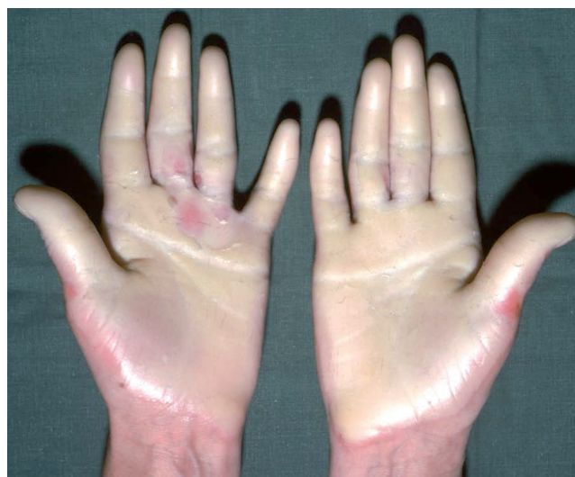
Fig. 1. The palms of a 43-year-old woman with palmoplantar keratoderma of the Gamburg-Nielsen type homozygous for the recurrent c.43T>C mutation in the SLURP1 gene. The picture shows a marked, sharply demarcated palmar keratoderma with a waxy appearance.

1 http://www.medicaljournals.se/acta/content/?doi=10.2340/00015555-1840