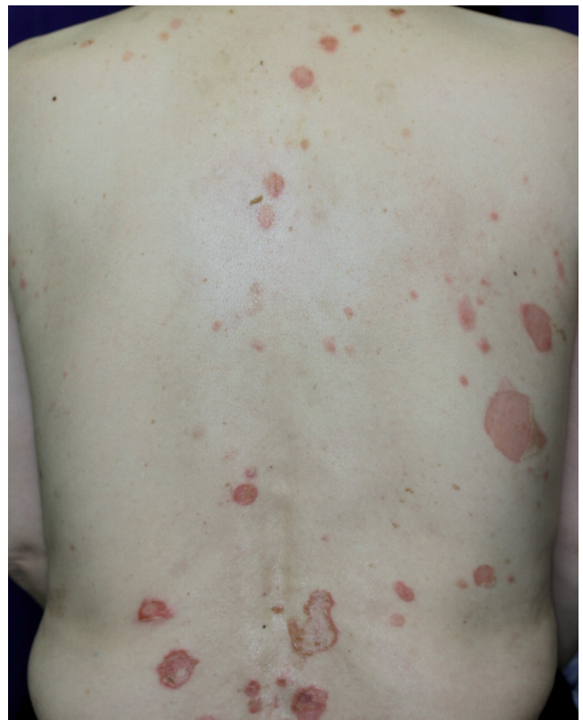
Fig. 2. Pruritic scaly, crusted eruptions and flaccid bullae involving the trunk at the exacerbation after electron-beam irradiation of the vulva.

have decreased (Fig. 1). At 9 months after aggravation, she has continued the prednisolone at a 10 mg/day maintenance dose.