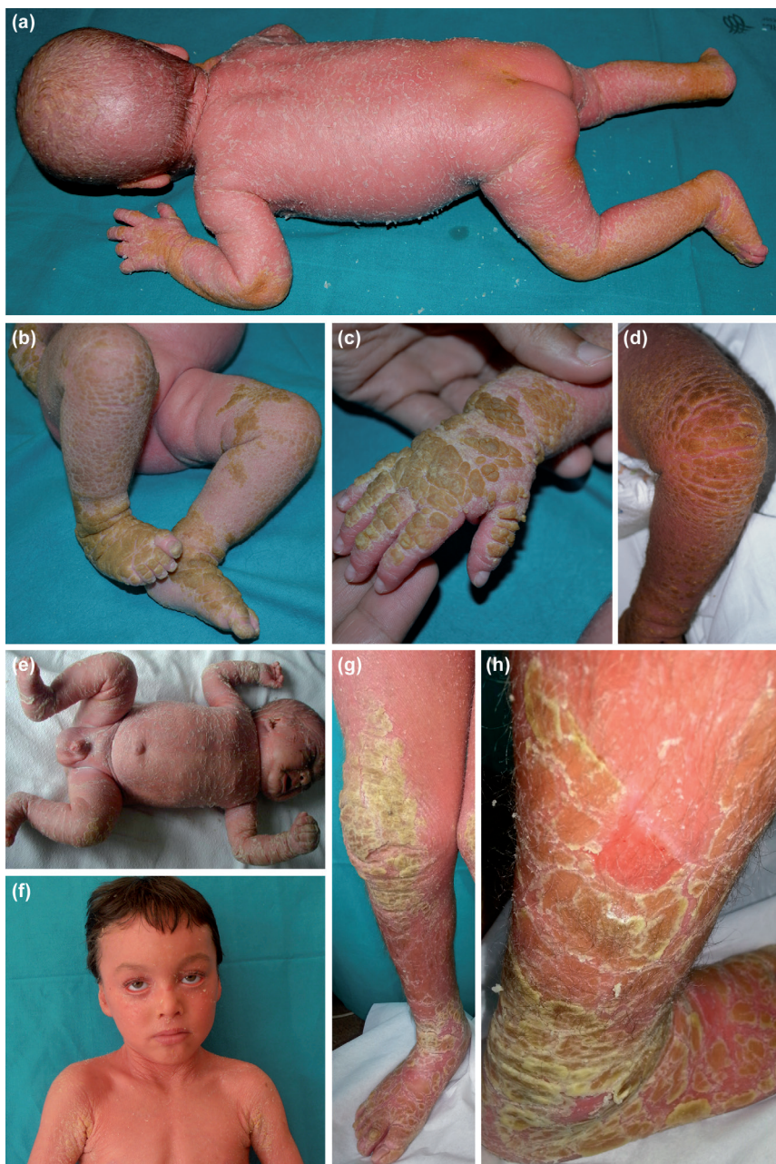
Fig. 1. Clinical features of Case 1 (a–d) and Case 2 (e–h) showing severe ichthyosiform erythroderma at the age of 3 (a) and 2 months (e), respectively, and subsequent development of massive adherent hyperkeratosis with a cobblestone and spiky appearance in Case 1 (b, c, age 1 year; d, age 1 year and 8 months). Hyperkeratotic plaques, more evident over joints, are also present in Case 2 despite retinoid treatment (f–h, age 5 years). Also note the hypertrichosis in Case 1 (d) and Case 2 (h).

In addition to physical therapy, moisturisers and mild keratolytics containing 5% urea and 1% lactic acid, acitretin 0.2 mg/