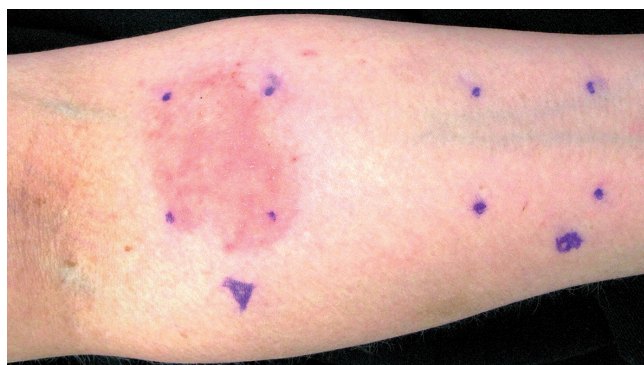
Fig. 1. A positive reaction to the repeated open application test of sample B (treated oak moss absolute) at 0.10% (w/v) in subject 12 on day 14.

The oak moss-allergic subjects applied a mean of 140 mg/day (range 88–230) of the ROAT solutions to each test site and the controls applied a mean of 130 mg/day (range 86–230).