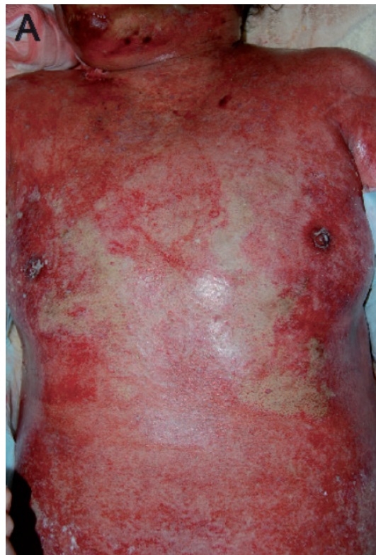
Fig. 1. Erosive and ulcerative lesions on the chest 7 days after starting cefozopran.