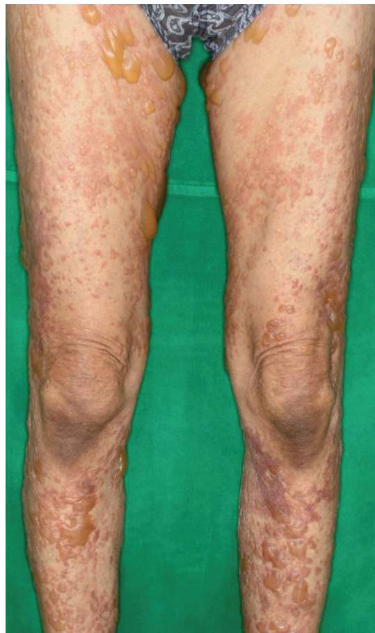
Fig. 1. Multiple flaccid and tense bullae and erosions on the lower extremities.

Direct immunofluorescence of the skin biopsy showed relatively weak deposits of IgG and IgA to keratinocyte cell surfaces, as well as linear IgA deposits along the basement membrane zone (BMZ). Indirect immunofluorescence using normal human skin showed IgA, but not IgG, anti-keratinocyte cell surface antibodies. Indirect immunofluorescence of 1M NaCl split normal human skin detected both IgG and IgA antibodies reactive with both epidermal and dermal sides of the split. Indirect immunofluorescence of rat bladder demonstrated both IgG and IgA antibodies reactive with the transitional epithelia. Furthermore, newly developed enzyme-linked