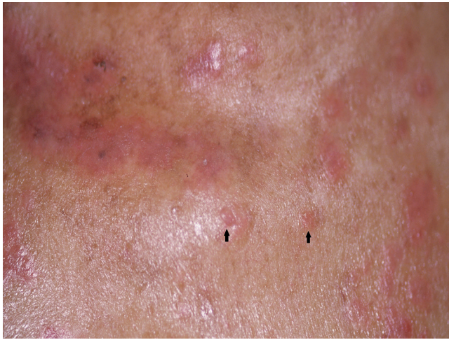
Fig. 2. Clear-fluid-containing, 1–1.5-cm, vesicles and well-defined erythematous scaly papules and plaques on the chest.

(11, 12). The paradoxical phenomenon of psoriasis exacerbation has also been reported for anti-tumour necrosis factors agents, which are well-recognized for their therapeutic benefits in psoriasis.